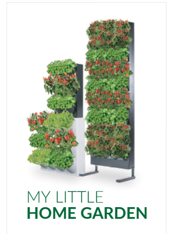
MY LITTLE HOME GARDEN