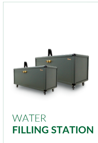
WATER FILLING STATION